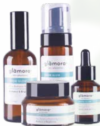
Snow Glow Fullset