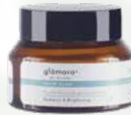
Pure Radiance Brightening Cream